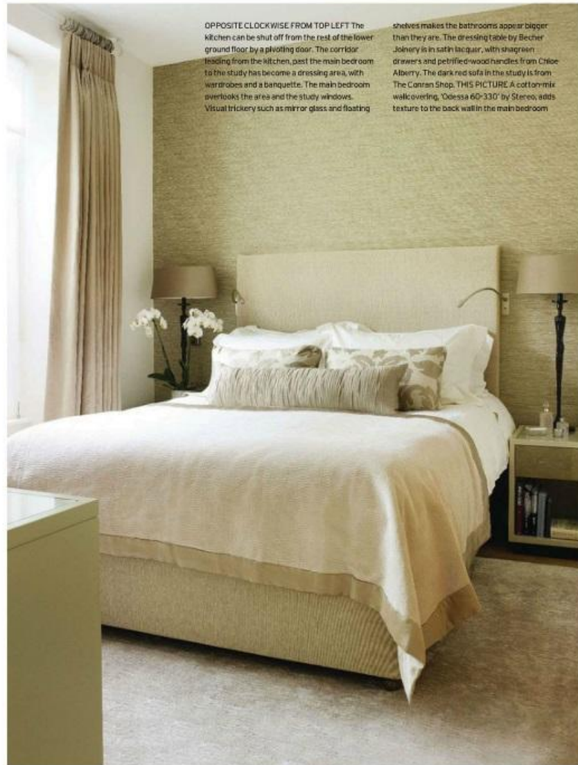
OPPOSITE CLOCKWISE FROM TOP LEFT The kitchen can be shut off from the rest of the lower ground floor by a pivoting door. The corridor leading from the kitchen, past the main bedroom to the study has become a dressing area, with wardrobes and a banquette. The main bedroom overlooks the area and the study windows. Visual trickery such as mirror glass and floating

Juliette Byrne: 020-7352 1553; www.juliettebyrne.com | Newman Ziegler: 020-8969 6154; www.newmanziegler.com | Sally Storey at John Cullen Lighting: 020-7371 5400; www.johncullenlighting.co.uk