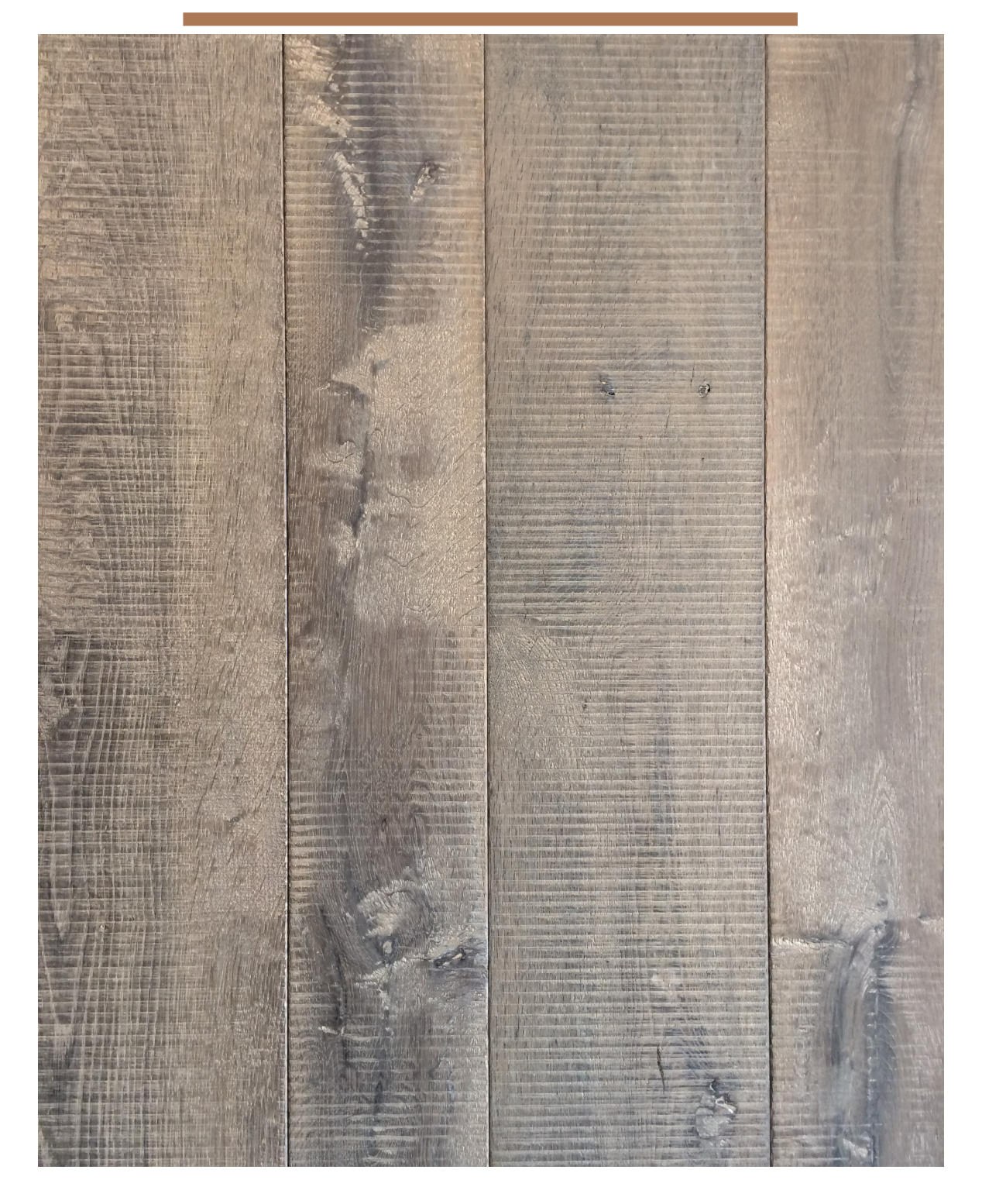
Our 2021 sale floor is a rustic, textured grey oak floor in a mixed width format for an authentic antique floor look