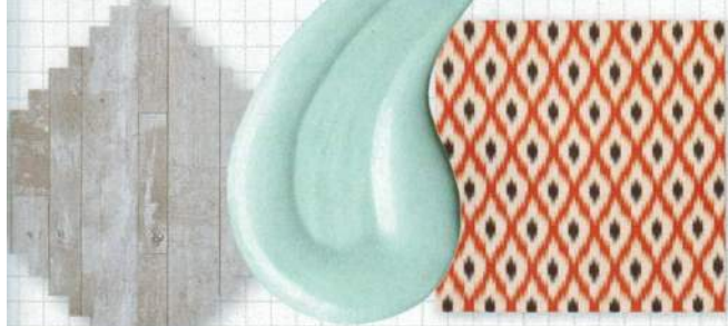
FROM LEFT Woodgrain wallpaper in Off White on Stone, £75 per 10m roll, Threads at Wallpaper Direct; Parma Gray estate emulsion, £36 for 2.5l, Farrow & Ball; and Ithaki F6480-05 acrylic, £71 per m (W142cm), Osborne & Little